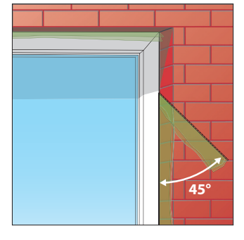
Fig 3: Pull the film carefully at an angle of 45°.