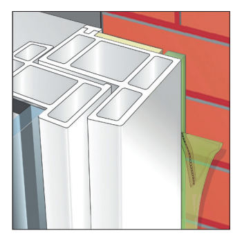
Fig 4: TP601 located between window and reveal.