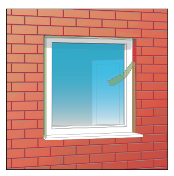
Fig 2: Activate the expansion of the tape by removing the tear-off film and